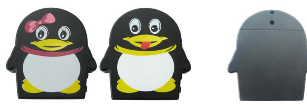
3.2 Rear face